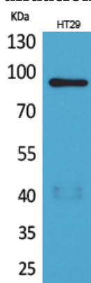
Fig1.; Western Blot analysis of HT29 cells using Neuregulin-2 Polyclonal Antibody.. Secondary antibody (catalog#: HA1001) was diluted at