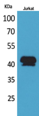
Fig1:: Western Blot analysis of Jurkat cells using BMP-8A Polyclonal Antibody.. Secondary antibody (catalog#: HA1001) was diluted at 1:20000