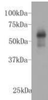
Fig1: Western blot analysis on recombinant protein using anti-KIAA0100 Mouse mAb (Cat. #