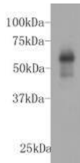
Fig1: Western blot analysis on recombinant protein using anti-KIAA0100 Mouse mAb (Cat. #