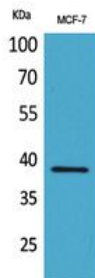
Fig1:: Western Blot analysis of MCF-7 cells using Cerberus Polyclonal Antibody. Antibody was diluted at 1:500. Secondary antibody [catalog#: HA1001] was diluted at 1:20000