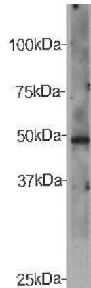
Fig1: Western blot analysis on recombinant protein of CELSR2 using anti- CELSR2 polyclonal