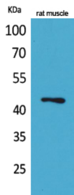
Fig1:: Western Blot analysis of rat muscle cells using KLF12 Polyclonal Antibody.. Secondary antibody (catalog#: HA1001) was diluted at 1:20000 cells nucleus extracted by Minute TM Cytoplasmic and Nuclear Fractionation kit (SC-003, Inventbiotech, MN, USA).