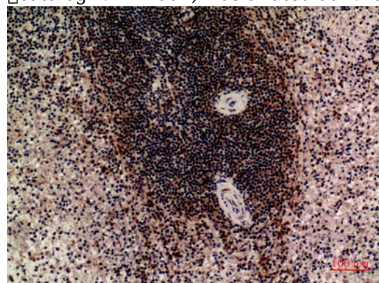
Fig2.; Immunohistochemical analysis of paraffin-embedded human-spleen, antibody was diluted at 1:100