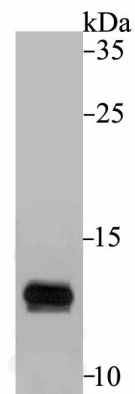
Fig1: Western blot analysis of APOC3 on human liver tissue lysate using anti-APOC3 antibody at 1/500 dilution.